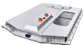
BEDS Battery Pack