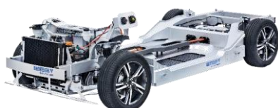
BEDS Rolling Chassis